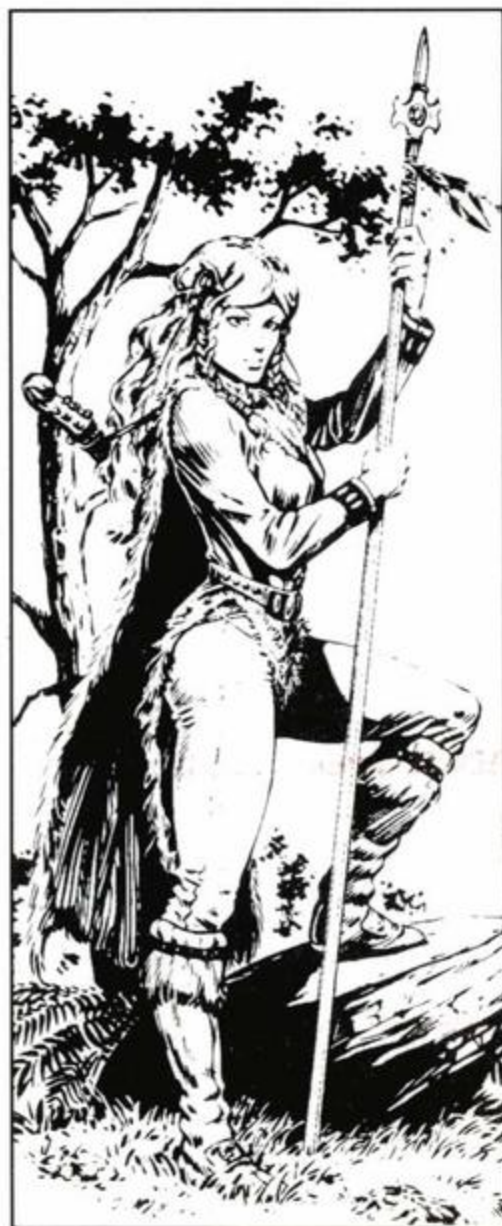
from "Dragons of Mystery"

Leather armor; Quarterstaff +2; Medallion of Faith; Clerical magic, see sub-menu.