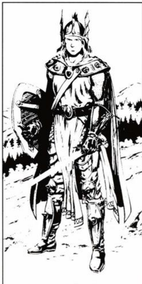
By Larry Elmore, from "Dragons of Mystery"

Ring mail armor; Longsword (damage 1-8); Spear (damage 1-6).