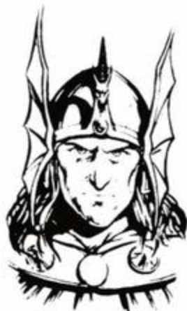
from "Dragons of Hope"

The twin brother of Raistlin, Caramon can be considered a complete opposite to his brother. From early childhood Caramon made himself the protector of his weaker brother, rescuing him time and time again from bullying tormentors. His training as a warrior was started by his sister, Kitiara, who later became a Dragon Highlord in the service of Takhisis.