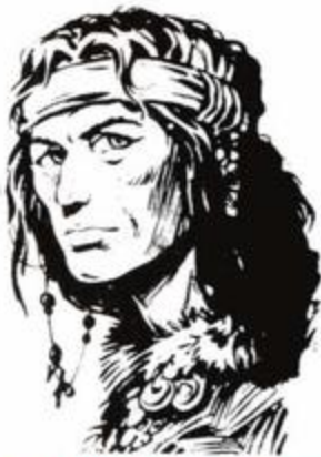
By Larry Elmore, from "Dragons of Hope"

Born into a family of virtual tribal outcasts, no-one in the Que-Shu tribe had a lower social position. His family refused to believe in the divinity of the tribal chieftain and were the last believers in the old gods. Tolerated for his skills, Riverwind would probably have been left alone to live his life had he not asked permission of the tribal chief to marry Goldmoon.