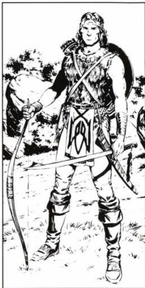
By Larry Elmore, from "Dragons of Mystery"

Leather armor & Shield; Longsword +2 (damage 1-8); Bow & quiver of 20 arrows (damage 1-6).