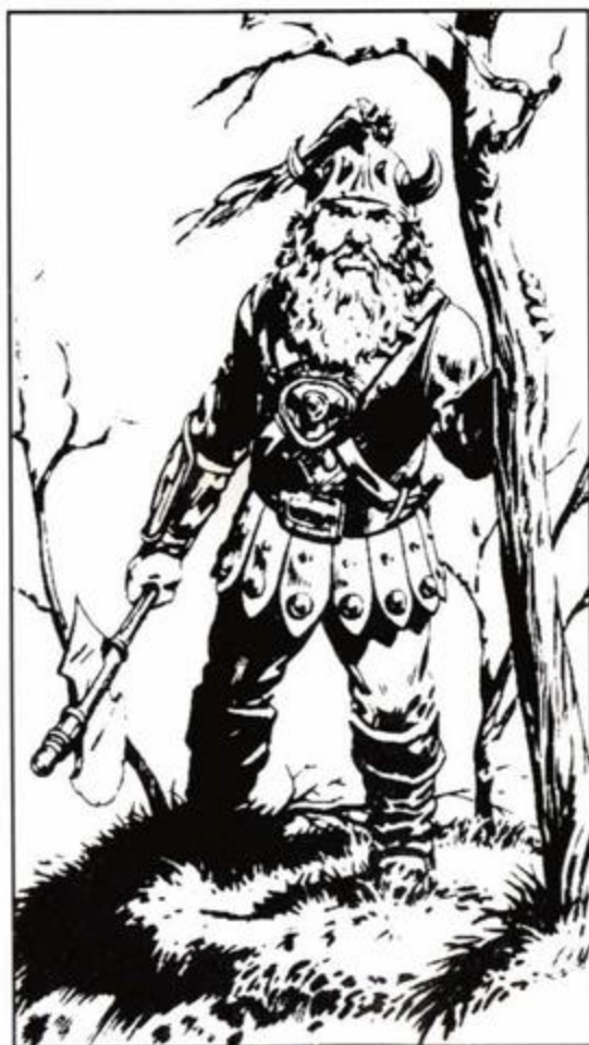
By Larry Elmore, from "Dragons of Mystery"

Studded Leather armor & Shield; Battleaxe +1 (damage 1-8); Throwing axes (damage 1-6).