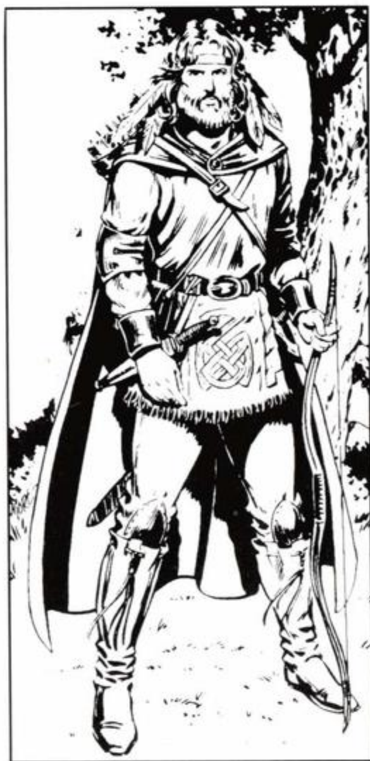
By Larry Elmore, from "Dragons of Mystery"

Leather armor +2; Longsword +2 (damage 1-8); Bow & quiver of 20 arrows (damage 1-6).