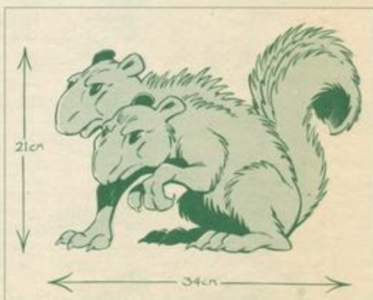
TWO HEADS BETTER THAN ONE? Not quite, say frightened folks, who fought off this furry freak.

A COUPLE CAMPING ON Mt. Rainier got a double dose of excitement when they were menaced by a vicious two-headed squirrel!