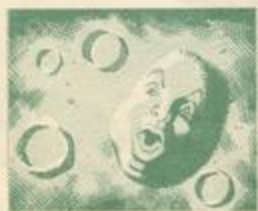
A FACE ON THE FACE OF MARS? Martian moonlit smiles for the camera of Viking 1 space probe in 1977.

A RUSSIAN SPACE PROBE has sent back actual re-touched photographs of an ancient intergalactic Coney Island—on the surface of the planet Mars!