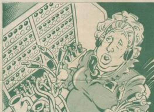
PHONE COMPANY PHONY? Some scientists think that phone workers like this are really space aliens!