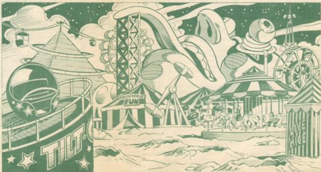
OUT-OF-THIS-WORLD amusement park looked like this, experts say.

The new photographs were taken in the same location where twenty years earlier, an American Viking 1 orbiter took photos of a giant human face.