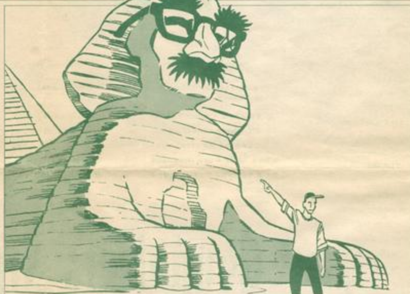
WHAT'S THE SECRET WORD? Is it, or maybe even death. That could be the punishment for the students who changed history with giant Groucho glasses. No word on whether they planned to disguise the three pyramids as Marpo, Chico, and Zeppo.

Brainy Drains, Inc. 2574 Sludgeway Avenue Knowles Atoll, Micronesia