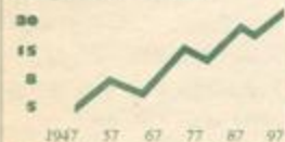
The popularity of nose glasses has been steadily increasing since 1947, experts say.