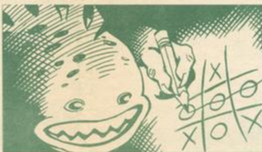
CREEPLY EGYPT CREATURE tossed two archaeologists out of the tomb like they were a couple of wet noodles!

a torch and made their way through the ominous opening. But just as they reached what appeared to be a treasure-filled room, they heard a blood-curdling scream.