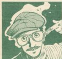
BOLT-BLASTED BRIT shows where lightning repaired his glasses.

Before his electric encounter, the witty Brit was so poverty-stricken that he couldn't afford to have his cracked beard ornament replaced.