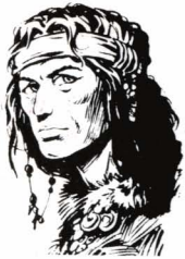
By Larry Elmore, from "Dragons of Hope"

Born into a family of virtual tribal outcasts, no-one in the Que-Shu tribe had a lower social position. His family refused to believe in the divinity of the tribal chieftain and were the last believers in the old gods. Tolerated for his skills, Riverwind would probably have been left alone to live his life had he not asked permission of the tribal chief to marry Goldmoon.